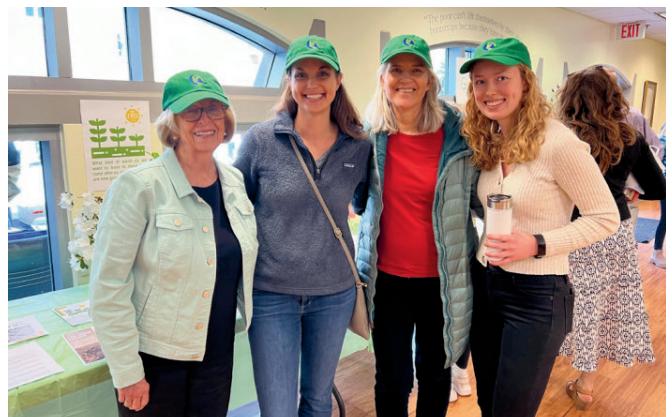
Green Fair 2023