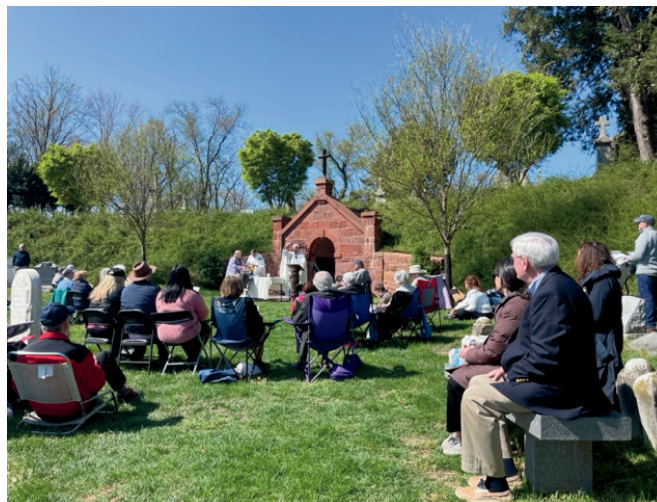
Easter Mass at Holy Rood.