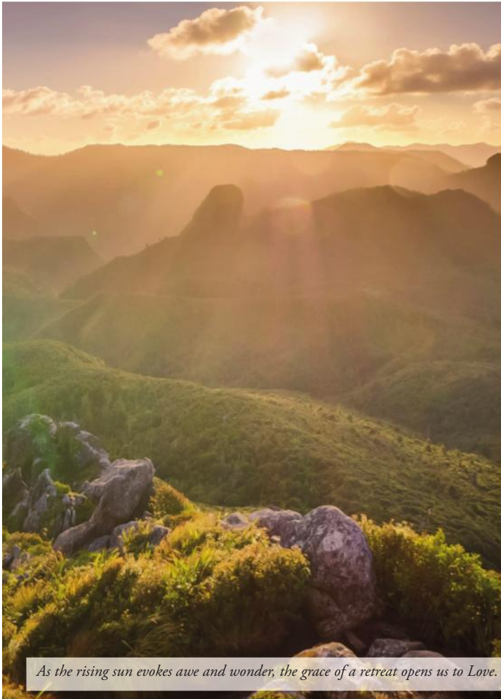
As the rising sun evokes awe and wonder, the grace of a retreat opens us to Love.