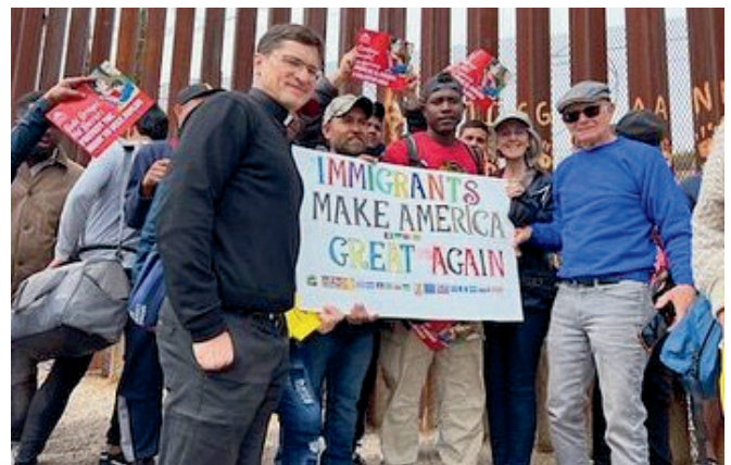
Holy Trinity parishioners joined jesuit organizations to shine a light on unjust policies by participating in the "We Say Welcome" event in Nogales, AZ and Nogales, Sonora.