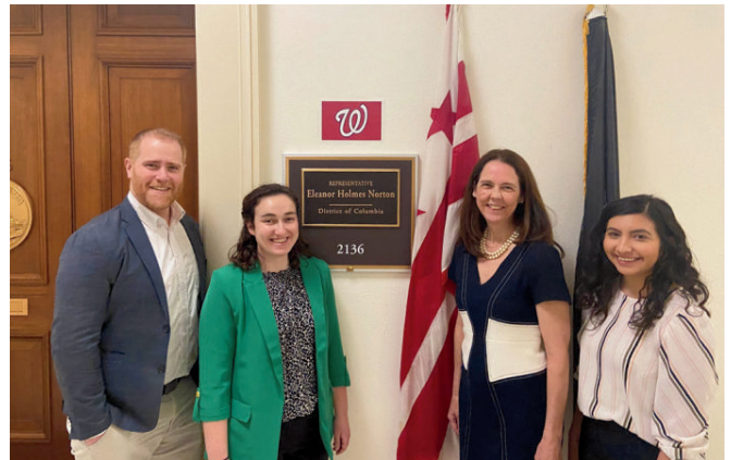
Holy Trinity parishioners participated in JRS Advocacy Day to ask DC and MD members of Congress to support legislation that would create a humane and just asylum system and provide funding for refugee assistance and mental health support.