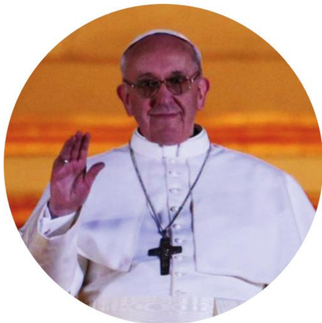
Newly elected Pope Francis appears on the central balcony of St. Peter's Basilica on March 13.

"This is a pontificate of fruits, yes, but also a pontificate of seeds, above all a pontificate of seeds. I think that with time, these seeds will grow, evolve and mature. We'll understand later what the fruits that have been planted during this time are" ✠.