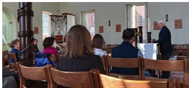
30 parishioners gathered in the Chapel of St. Ignatius to pray the Eco Examen led by the Green Team.