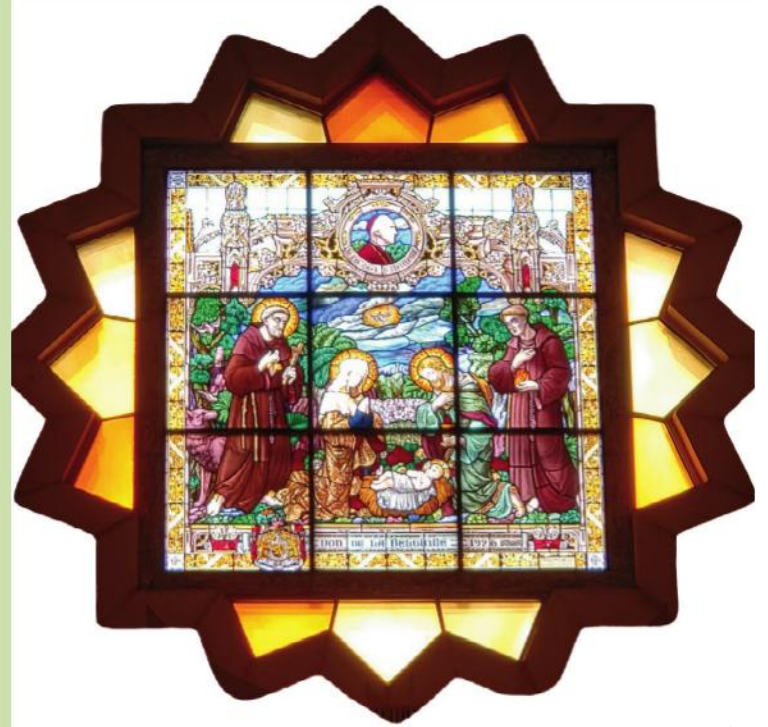
Stained glass located in the Church of the Nativity, Bethlehem

The Trinity Hall 9:00 AM Mass will return on the Epiphany of the Lord (Jan. 8).