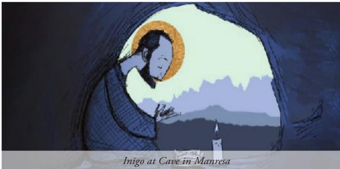
Inigo at Cave in Manresa

Come away for a weekend to reflect on life and faith, and share fellowship with other young adults at the What Next: Finding Answers with Faith retreat. Peer speakers, small and large group discussions, and quiet time for prayer and reflection will give us ample opportunity to explore how to navigate, with faith and grace, the transitions that are inherent in life. Registration and more info: trinity.org/fyac-retreat/