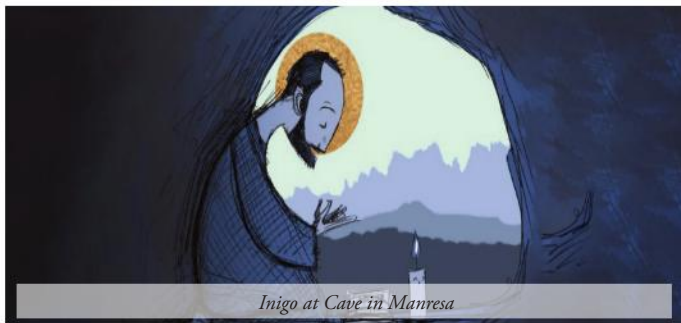
Inigo at Cave in Manresa

If you are curious about the events that transpired in the life of Inigo López de Loyola after being hit by a cannonball in 1521 that led to the Spiritual Exercises, join us for an hour conversation on Saturday at 11:00am . We will include details about the nine-month retreat and how one can prepare to make this spiritual journey. Contact moshea@trinity.org for the zoom link and more information.