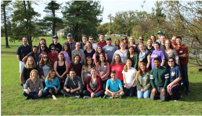
2017 YAC Retreat participants